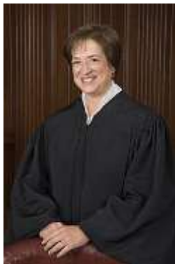
Elena Kagan (2013)

Elena Kagan attended Hunter College High School, where her mother taught. The school had a reputation as one of the most elite learning institutions for high school girls and attracted students from all over New York City.